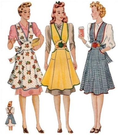
9 - Illustration from an apron pattern c1940s

The trend of fashionable aprons continued through the 1960s. By the 1980s the working woman spent less time in the kitchen and new apron fashions weren't present in stores or in pattern company catalogs as much. Then, in the mid 2000s vintage styles became popular again, and many pattern companies began re-releasing styles, including aprons. (10) Online bloggers and crafters have made home-making attractive again, and a new generation had discovered the necessity and utility of aprons.