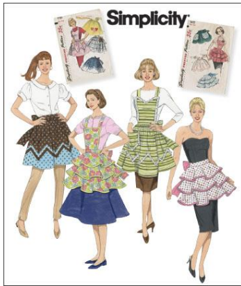
10 - Simplicity Retro Apron Pattern #2592

The trend of fashionable aprons continued through the 1960s. By the 1980s the working woman spent less time in the kitchen and new apron fashions weren't present in stores or in pattern company catalogs as much. Then, in the mid 2000s vintage styles became popular again, and many pattern companies began re-releasing styles, including aprons. (10) Online bloggers and crafters have made home-making attractive again, and a new generation had discovered the necessity and utility of aprons.