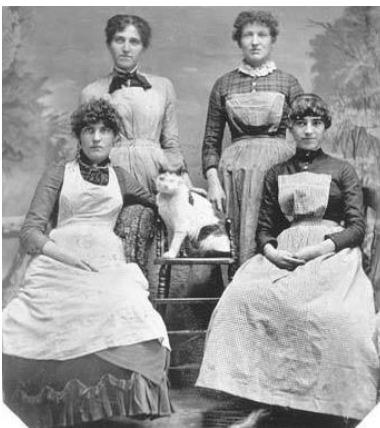
6 - House staff with mouser. c1865