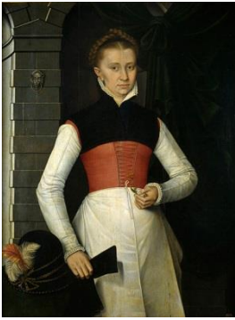
2 - "Lady with a Yellow Flower" by Cronenberg c1567

By the 1940s aprons were becoming a fashion statement in their own right, pictured by pattern companies over more plain looking dresses. (9)