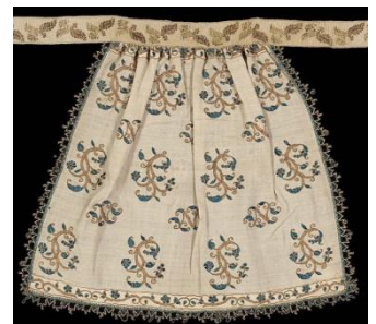
3 - a European apron of linen with gold and silk embroidery c1600s