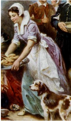
4 - Detail from "The First Thanksgiving 1621" by Ferris