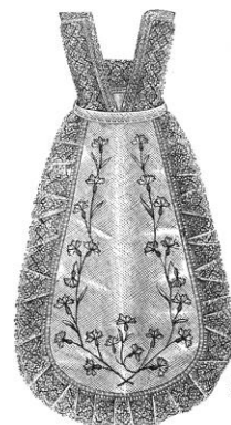
7 - Victorian era aprons. c1900s