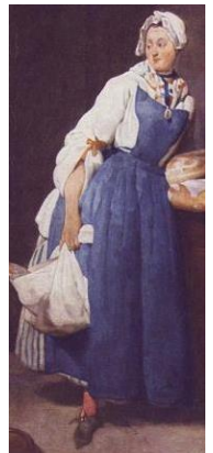
5 - Pinner apron. c1700s